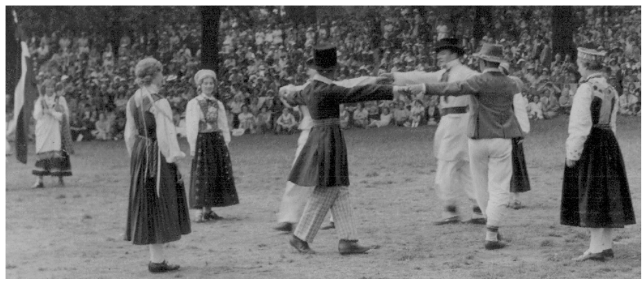
Latvian Dancers circa 1935